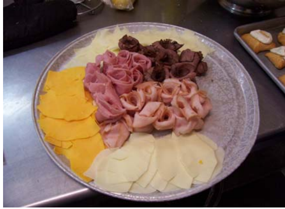
Meat flowers and cheese leaves for the Royal Lunch